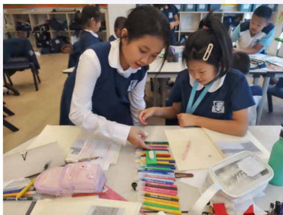
Grade 4 pupils showing iTeamUp whilst conducting a science investigation. 四年级学生在进行科学调查时展现iTeamUp合作。

最近，我们的老师为学生们创造了跨学科的项目学习机会。一二年级对海洋生物进行了研究，三四年级进行了一系列科学实验。在这些项目中，我们鼓励学生用双语学习新的词汇，并形成书面成果，以显示他们在这些学科领域的学习和进步。在这些项目中，孩子们做了很多出色的工作，他们非常高兴能在本周二和周三上午与家长分享这些成果。请一定来看看、听听您的孩子在最近几周的学习情况。